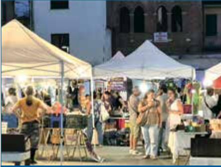
SUMMER FAIR UNDER THE STARS