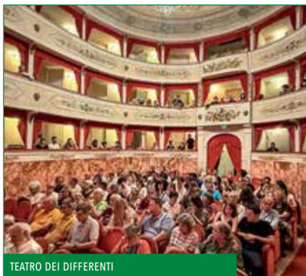
TEATRO DEI DIFFERENTI

Teatro dei Differenti was built in 1795 from a previous one of 1689. It is one of the best preserved and most prestigious theatre of its size in Tuscany. Every year it hosts an important theatrical season and Barga Jazz festival.