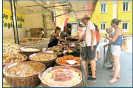
SANTA MARIA AND SAN ROCCO FAIR