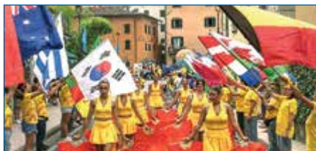
"MULETTO" AND COUNTRYSIDE FEAST

🌐 quattroarchibarga.com 📷 quattro_archi_barga