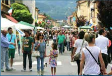
2ND JUNE FAIR IN FORNACI