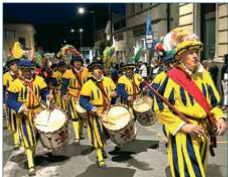
SAINT CHRISTOPHER AT BARGA

of participants and figures in costume. The religious feast continues on the 25th with Holy Mass at the Duomo at 11.15 am.