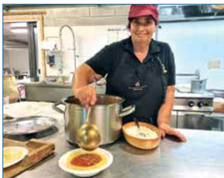
POLENTA AND BIRD FESTIVAL IN FILECCHIO