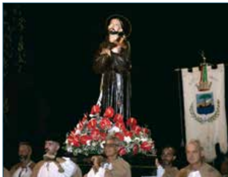
PROCESSION AND FORGIVENESS OF SAINT FRANCIS OF ASSISI