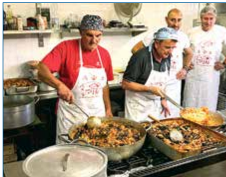
CASTELVECCHIO VILLAGE FESTIVAL