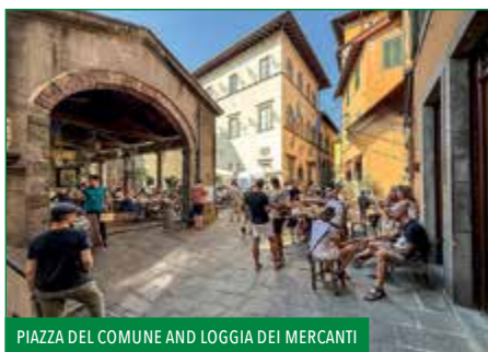
PIAZZA DEL COMUNE AND LOGGIA DEI MERCANTI

Piazza Angelio and Piazza del Comune are the heart of the Historical Centre and are surrounded by Medici period buildings. Here you can find some popular bars and restaurants to spend a relaxing moment in Barga.