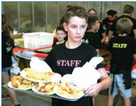
"FISH AND CHIPS" FESTIVAL

Organised by the Blood Donor and Misericordia Associations of Castelvecchio Pascoli outside the ex-primary school. 3 days of traditional dinner with orchestra and dancing under the stars. Specialities: tortelli with meat sauce, pork shank and chips, tripe, grilled meat, fish soup and home made cakes. Dancing on all 3 evenings: On the first for the young, on the other two ballroom dancing.