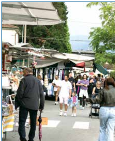
FIERA DEL 2 GIUGNO A FORNACI

weekly basis at the Farmer market in Fornaci di Barga where you can find a delicious but economical range of short food supply chain products.