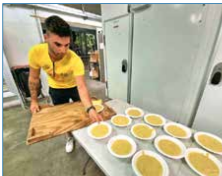
POLENTA AND BIRD FESTIVAL IN FILECCHIO

Excellent cuisine: this is the official programme of the 2025 edition of the Polenta and Bird Festival promoted by the Parish