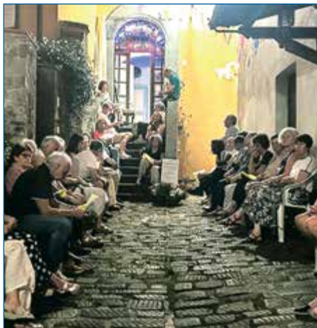
CONCERT AT THE WINDOW