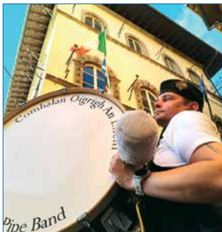
BARGA SCOTTISH FESTIVAL