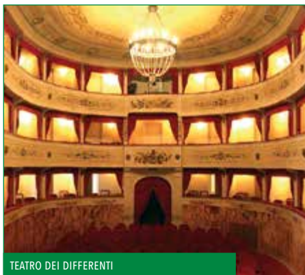
TEATRO DEI DIFFERENTI

Teatro dei Differenti was built in 1795 from a previous one of 1689. It is one of the best preserved and most prestigious theatre of its size in Tuscany. Every year it hosts an important theatrical season and Opera Barga and Barga Jazz festivals.