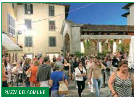
PIAZZA DEL COMUNE

Piazza Angelio and Piazza del Comune are the heart of the Historical Centre and are surrounded by Medici period buildings. Here you can find some popular bars and restaurants to spend a relaxing moment in Barga.