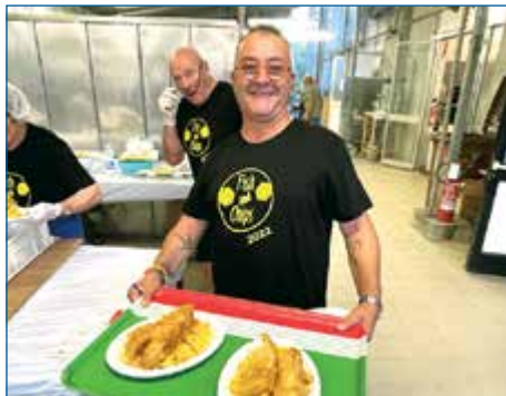
"FISH AND CHIPS" FESTIVAL

The Fish and Chips Festival is ready to go and celebrates in this way the Barga Scot-