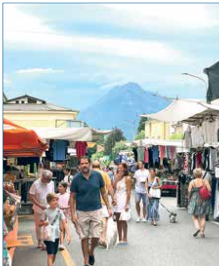
FIERA DI SANTA MARIA E DI SAN ROCCO