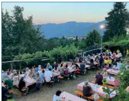
LE PIAZZETTE DI BARGA