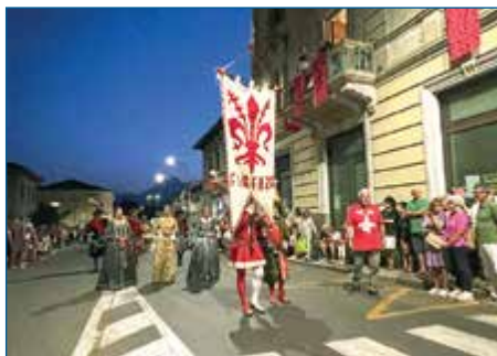
SAINT CHRISTOPHER AT BARGA