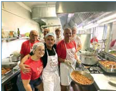
CASTELVECCHIO VILLAGE FESTIVAL

Specialities: tortelli with meat sauce, fish soup, pork shank and chips, tripe, grilled meat and other delicacies.