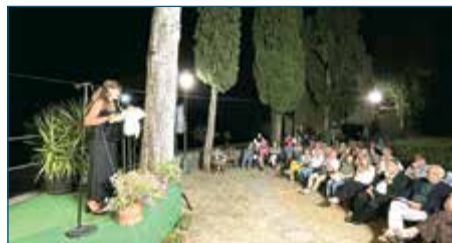
THE MEMORY OF BARGA